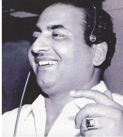
Mohammed Rafi (Dec. 24, 1924 – July 31, 1980)

Please join us as we sing the melodious songs immortalized by the great singer Rafi!